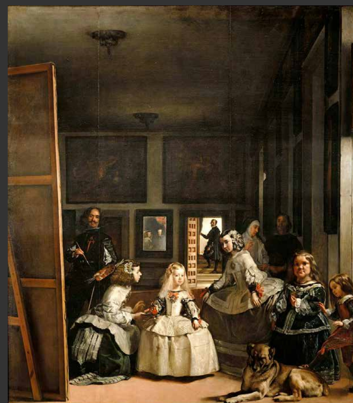
Diego Velázquez. „Las Meninas“, 1656; El Prado, Madrid